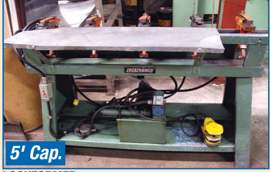
OCKFORMER 5 HEAD DUCT NOTCHER