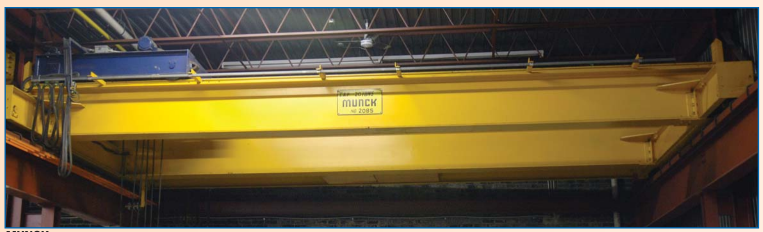
MUNCK 20 TON CRANE, 26'8" SPAN